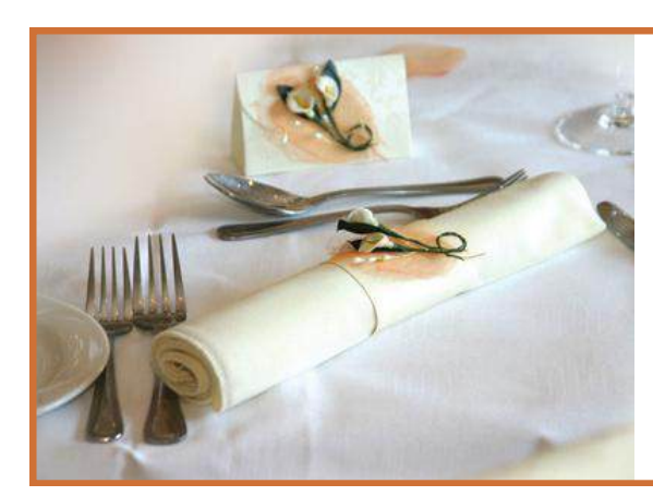
WEDDING PACKAGE 03