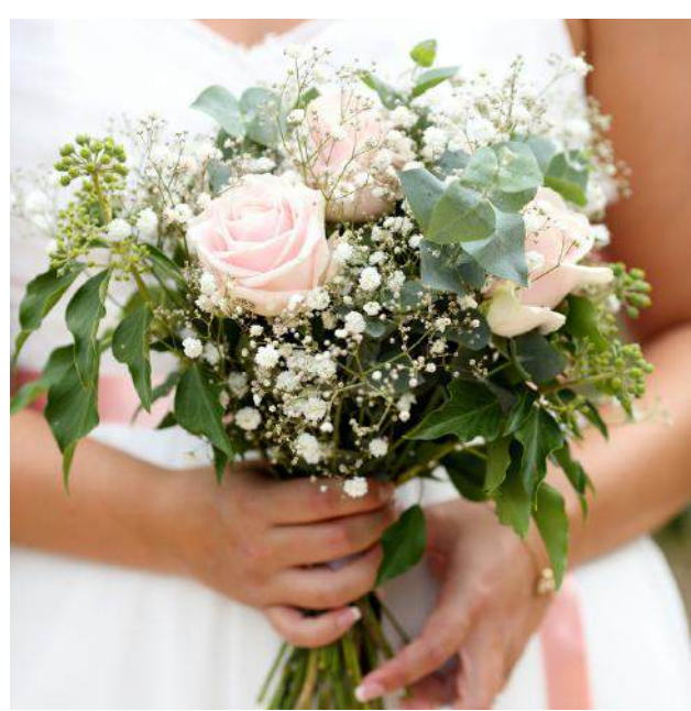
"At Kiltimagh Park Hotel, we believe every wedding should be as unique & special as the couple celebrating it...